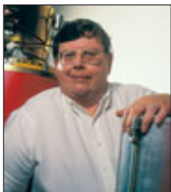
UNIVERSITY OF HAWAII